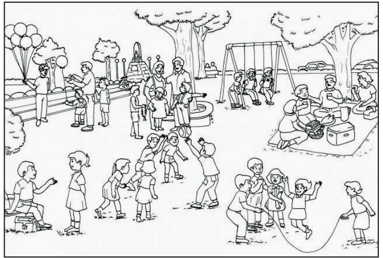
Study the picture and fill in the blanks in the text given below. The first one is done for Test-3 you.