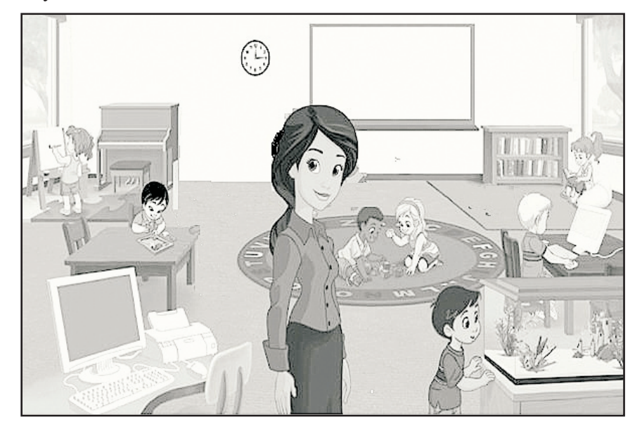
Test-04 Fill in the blanks with suitable words given within brackets. The first one is done for you. (05 marks)